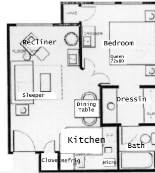
One Bedroom Suite 456 Sq Feet